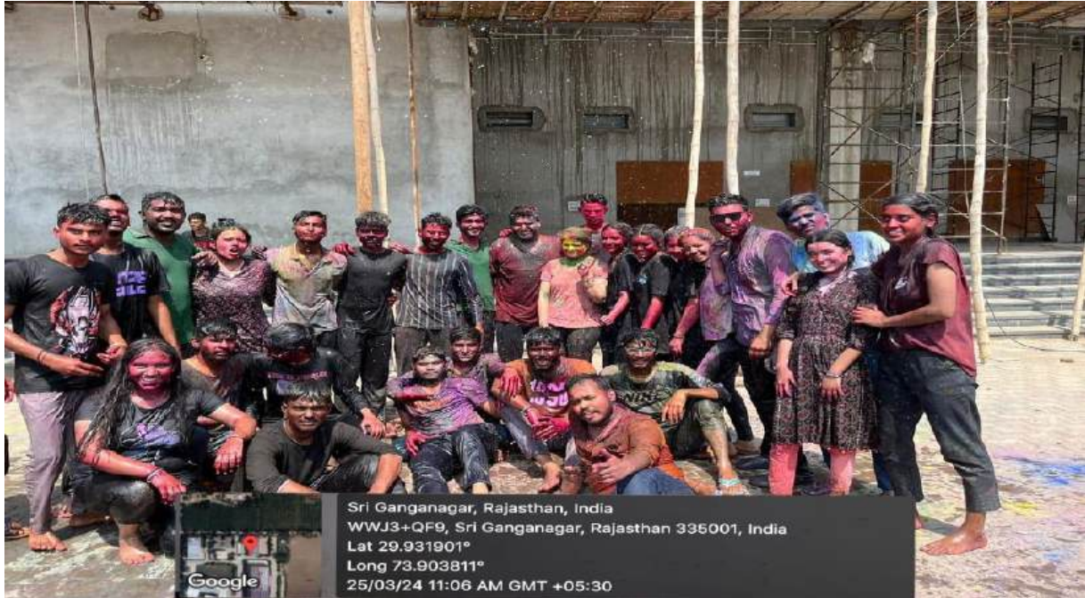
Sri Ganganagar, Rajasthan, India WWJ3+QF9, Sri Ganganagar, Rajasthan 335001, India Lat 29.931901° Long 73.903811° 25/03/24 11:06 AM GMT +05:30