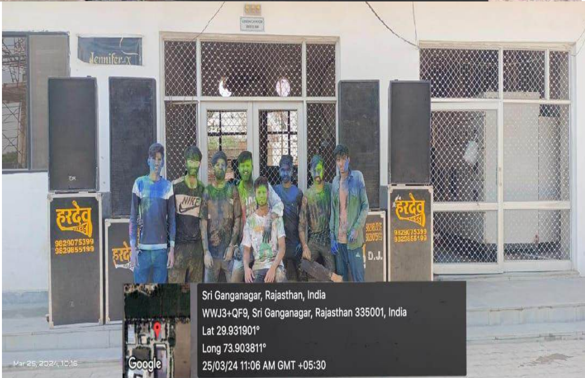
Sri Ganganagar, Rajasthan, India WWJ3+QF9, Sri Ganganagar, Rajasthan 335001, India Lat 29.931901° Long 73.903811° 25/03/24 11:06 AM GMT +05:30