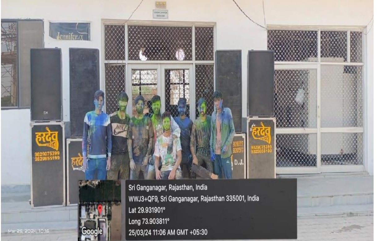
Sri Ganganagar, Rajasthan, India WWJ3+QF9, Sri Ganganagar, Rajasthan 335001, India Lat 29.931901° Long 73.903811° 25/03/24 11:06 AM GMT +05:30