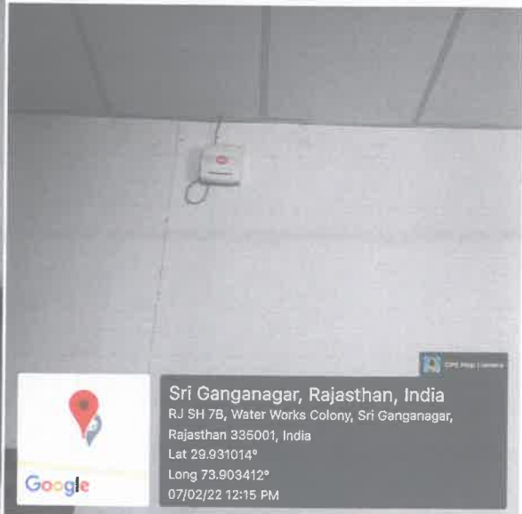
institutions Sri Ganganagar, Rajasthan, India RJ SH 7B, Water Works Colony, Sri Ganganagar, Rajasthan 335001, India Lat 29.931014° Long 73.903412° 07/02/22 12:15 PM