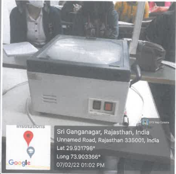
institutions Sri Ganganagar, Rajasthan, India Unnamed Road, Rajasthan 335001, India Lat 29.931798° Long 73.903366° 07/02/22 01:02 PM