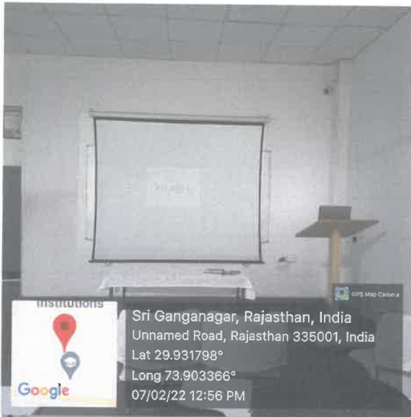
institutions Sri Ganganagar, Rajasthan, India Unnamed Road, Rajasthan 335001, India Lat 29.931798° Long 73.903366° 07/02/22 12:56 PM