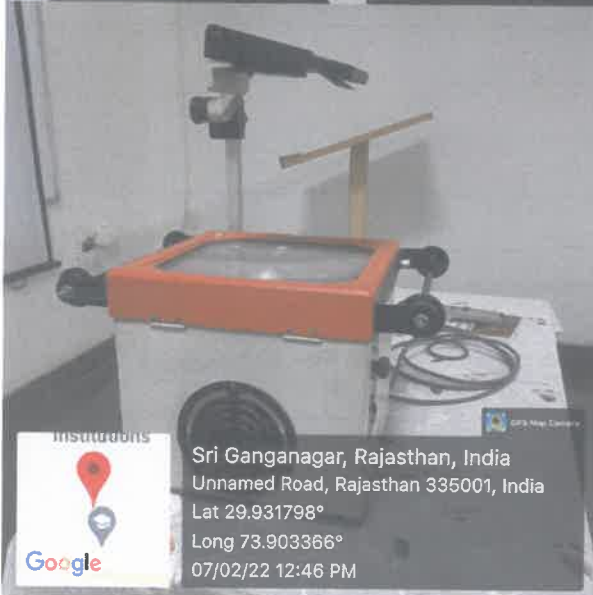
institutions Sri Ganganagar, Rajasthan, India Unnamed Road, Rajasthan 335001, India Lat 29.931798° Long 73.903366° 07/02/22 12:46 PM